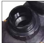
Unions kit included (50 or 63 mm)