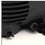
Double drain with easy opening (no tools required)