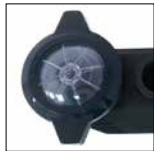
See-through Twist-Lock strainer cover